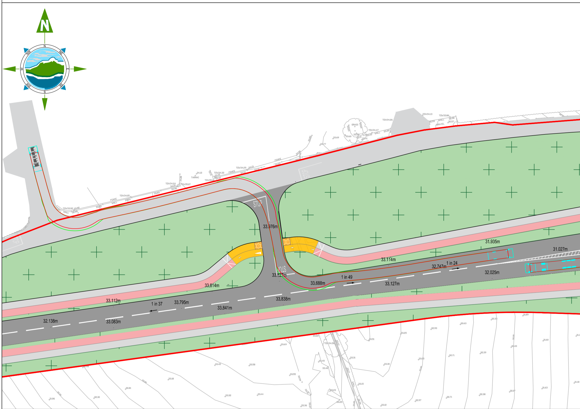
EXISTING ROAD SWEPT PATH - FIRE TRUCK